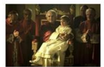
Director Marco Bellocchio's Kidnapped

seldom told and represented in Italian books and films.