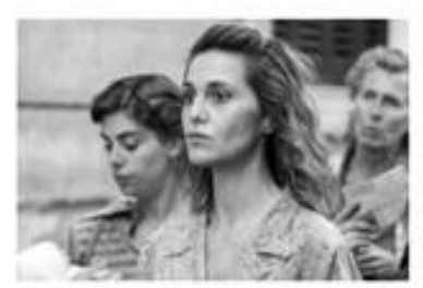
There's Sbill Tomorrow (C'll ancore doman)